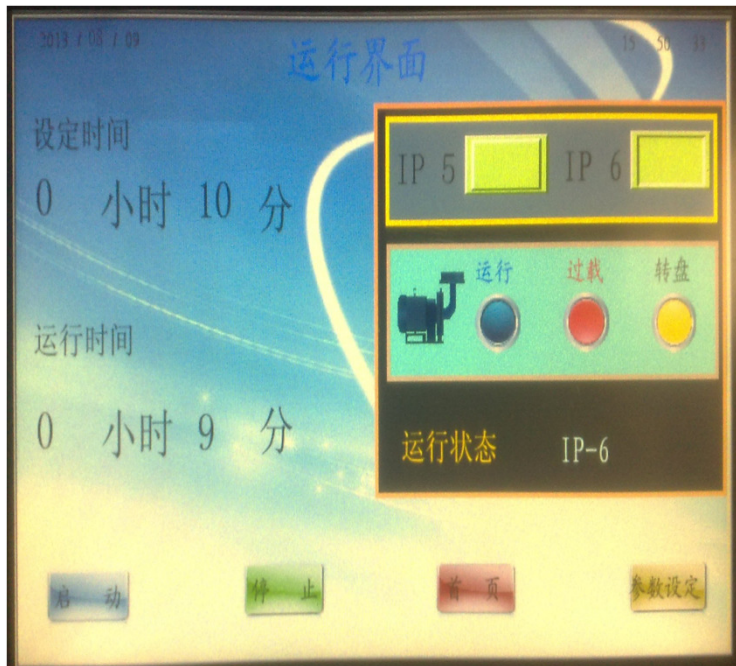
Diagram form 1