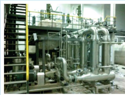
Ceramic membrane plant on site