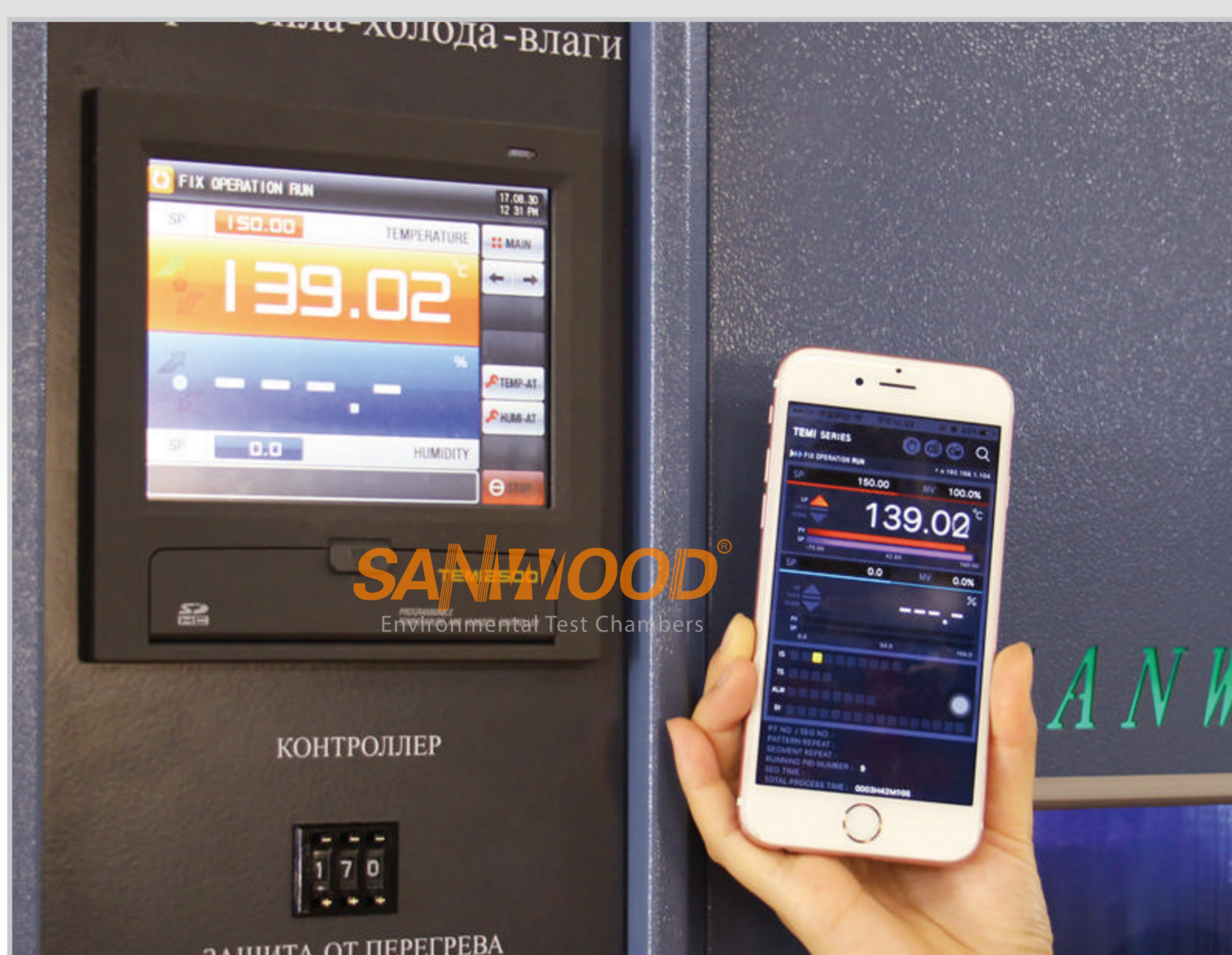
Remote network system