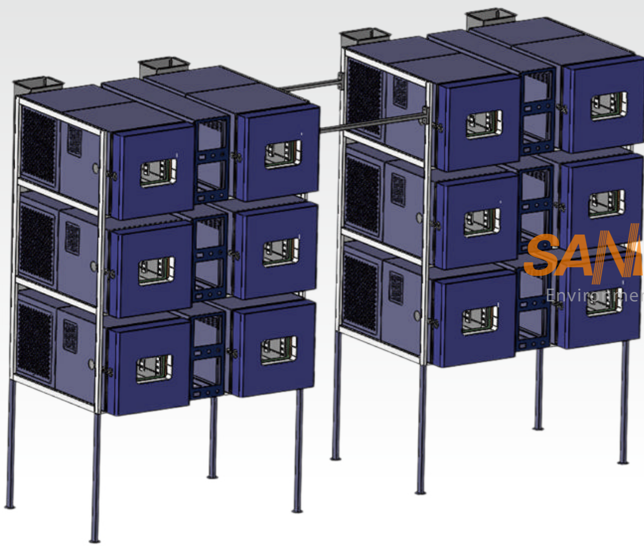
Optimal space use with stand options