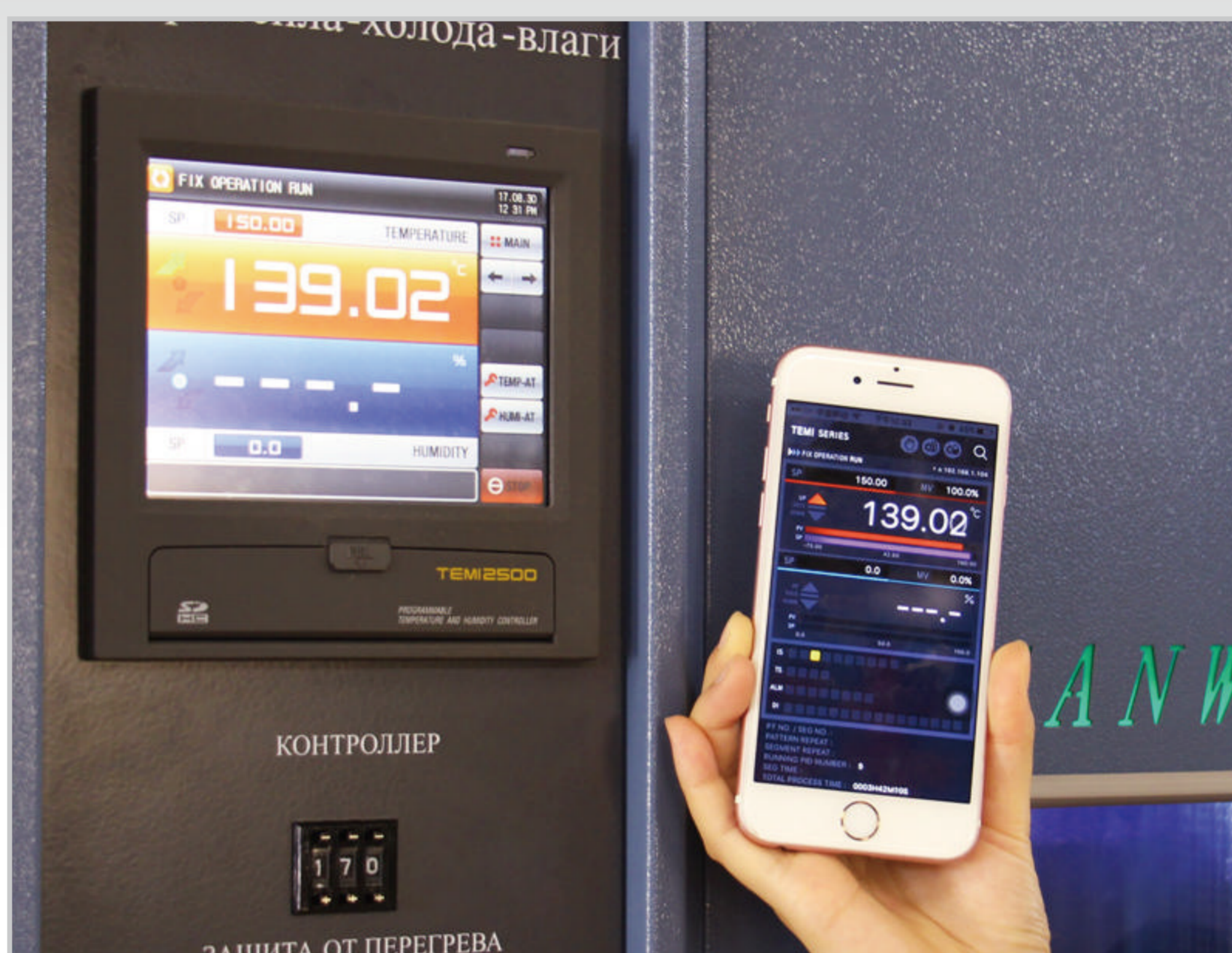
Remote network system