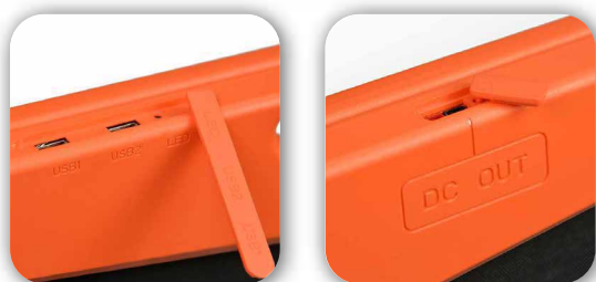
— Product details —