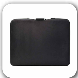
— product details —