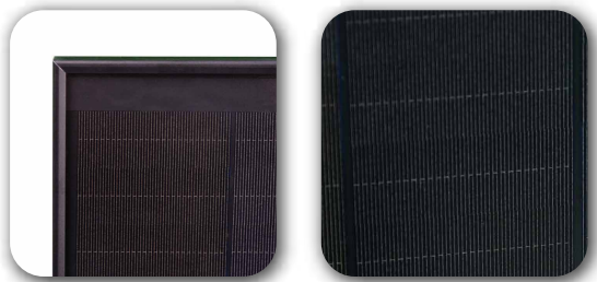
— Product details —