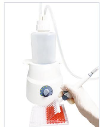
96-well plate, microtiter plate