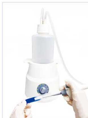
15/50ml centrifuge tube