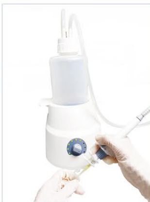
1.5/2ml ep tube